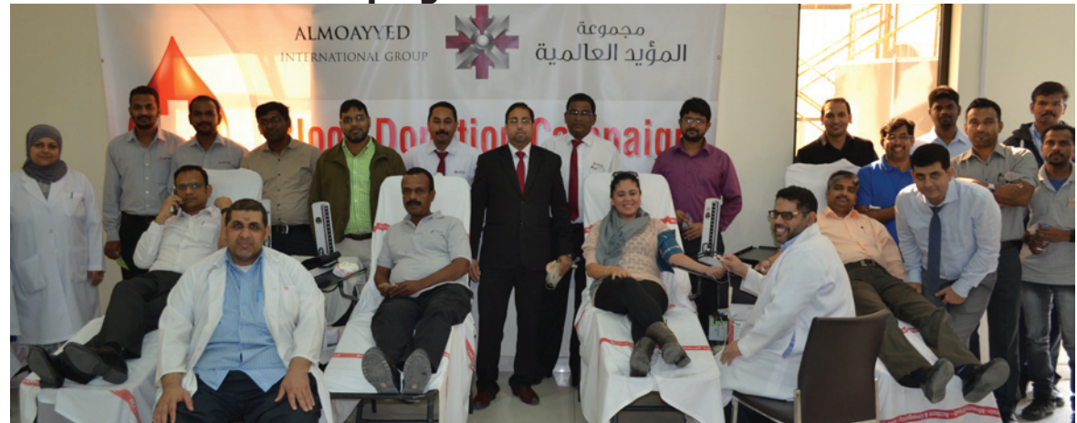
Blood Donation Campaign organized in collaboration with Salmania Medical Complex, Central Blood Bank at AIG office premises on 21st December 2016. The campaign was a great success with number of donars.