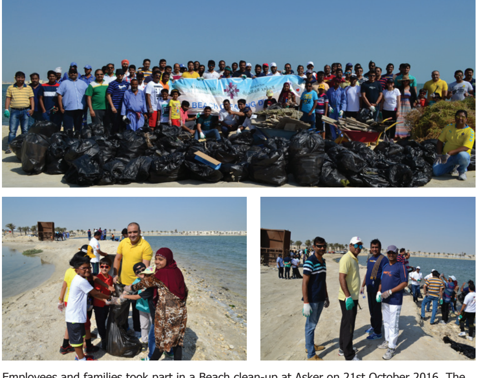
Employees and families took part in a Beach clean-up at Asker on 21st October 2016. The event was a great success with a significant number of participants.