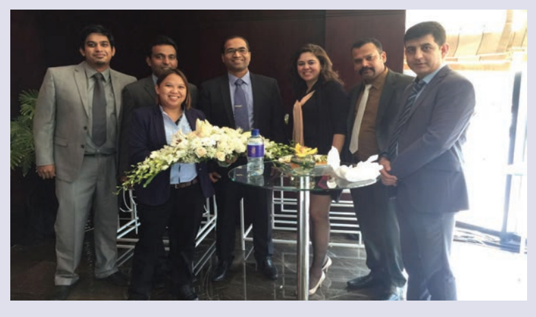
iWorld Connect along with Cisco have jointly hosted a seminar on 23rd of March at Ritz Carlton - Seef focusing the new Collaboration Solutions to their valued clientele.