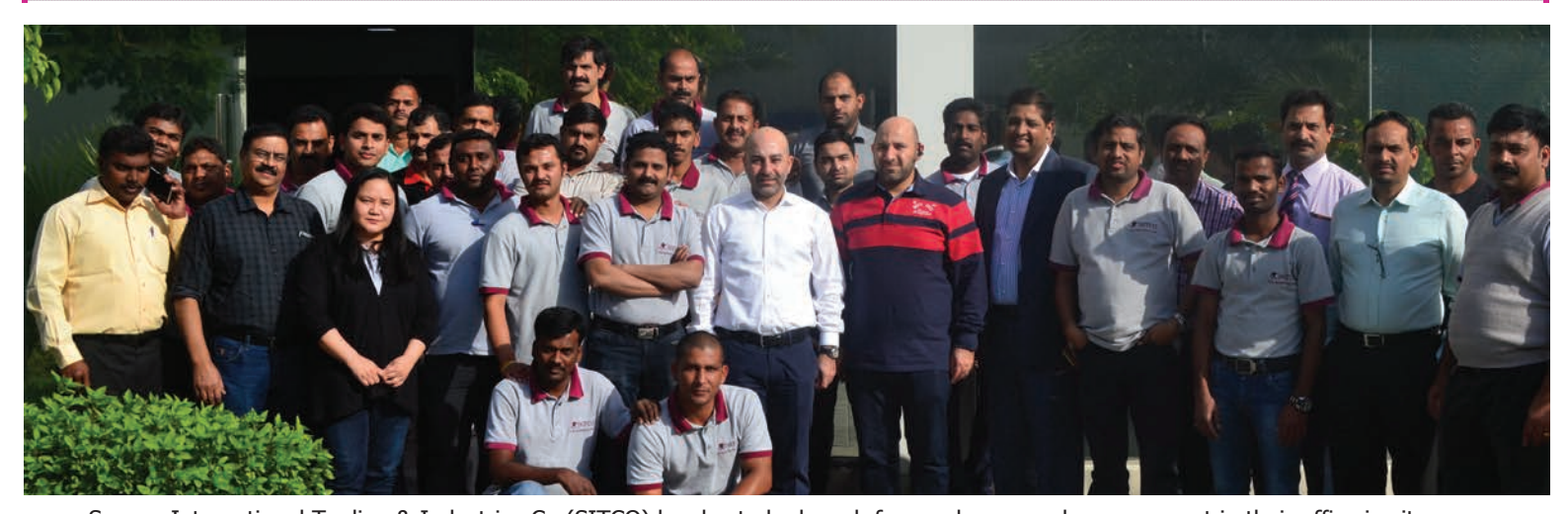
Season International Trading & Industries Co (SITCO) has hosted a launch for employees and management in their office in sitra.