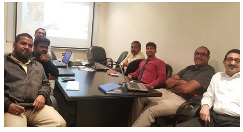
Almoayyed Computers team attended the WorldWide Virtual Launch of Microsoft Axapta (AX) ERP.