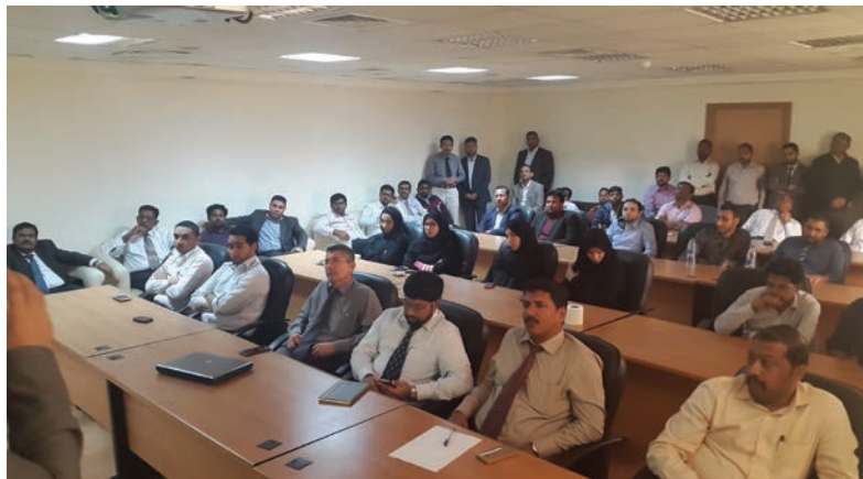
TAKAUD Saving & Pensions has conducted a presentation to introduce their savings plan to AIG staff on 11th February 2016. The Plan, which is known as the Almoayyed Employee Savings Plan is a Voluntary savings plan which allows you to contribute a fixed monthly amount, as decided by you. The Plan was designed for supplemental savings, which can provide you with a lump sum benefit or a steady periodic income.