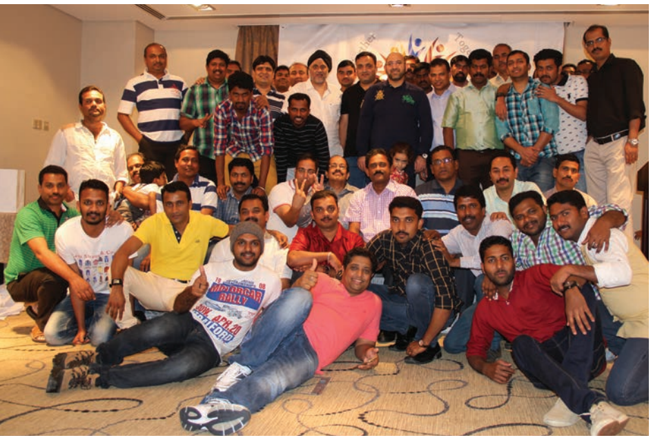
Almoayyed Safety & Industrial Center has hosted its annual staff party at K-Hotel on 25th February 2016 among the employees and their families. There were several entertainments, awards and prizes presented during the celebration. The staff party enables all of us to work better as a team and pursue our goals more effectively. Such events also encourage people to come together spend quality time with their colleagues away from the busy schedules of the work place.