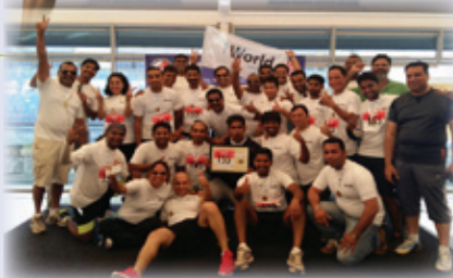
Team iWorld connect