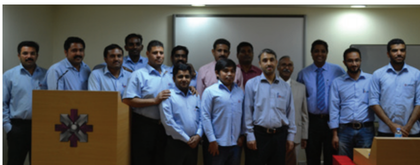
Almoayyed Commercial Services honoured technical staffs who has achieved Konica Minolta Outward Certifications