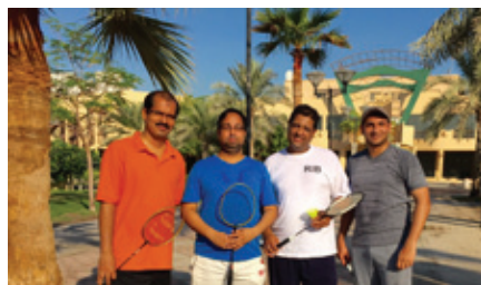
Cricket and Badminton practice during weekend