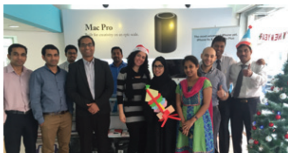
iWorld connect has organized Christmas and New Year celebration in the office.