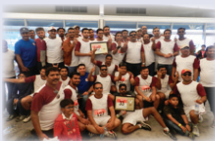
Team Almoayyed Computers