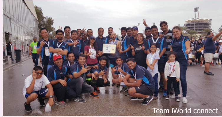
Team iWorld connect

Almoayyed Computers and iWorld connect have participated for kingdom's biggest charity event Bahrain Marathon Relay 2017 at Bahrain International Circuit organized by Bahrain Round Table. Organizers estimated that more than Bd.30,000 was raised from the event which will go towards various local charities.