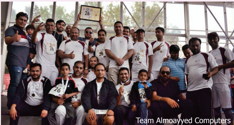
Team Almoayyed Computers